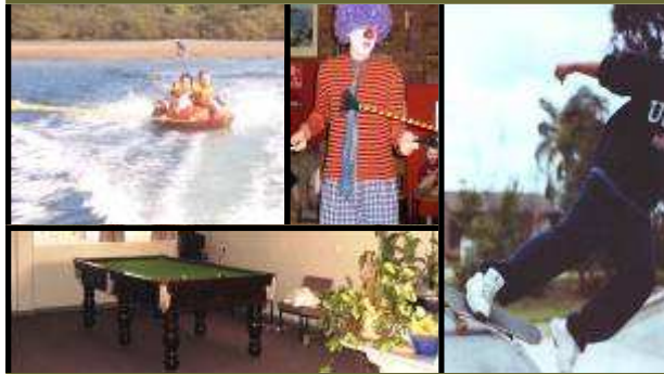
Skateboarding, pool, donuting, acting,