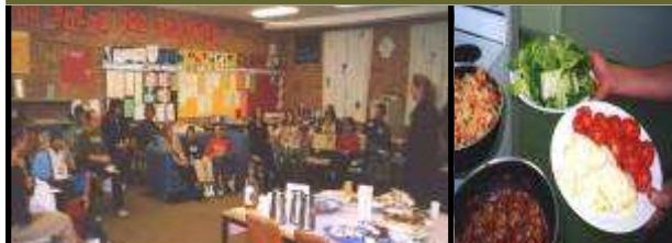
Classroom activities, food tech, swimming...